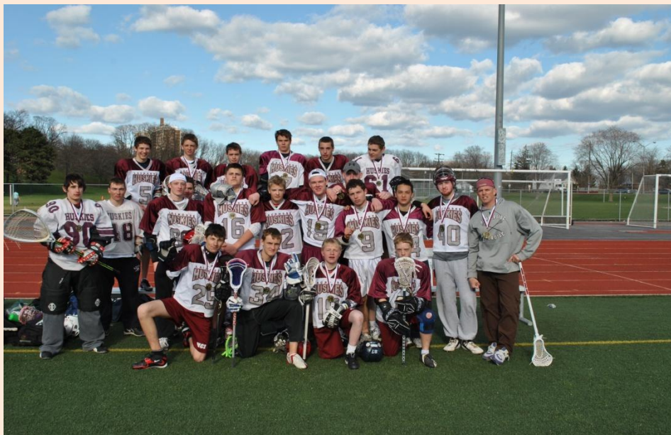
Above → 2012 Neil McNeil Invitational Champions

2012 was a very interesting year for the Varsity Boys Field Lacrosse team. Fielding a team of veteran players for the first time in HCI history, we exploded out of the gate and dominated the Neil McNeil Pre-Season Tournament @ Birchmount Park Stadium - beating East York Collegiate 8-5 in the Championship game.