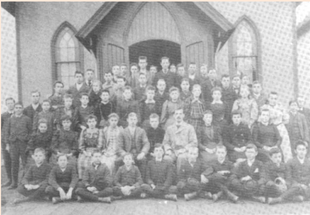
The original Humberside family

In the beginning, Humberside was originally housed in the Victoria Presbyterian Church on the southeast corner of Annette Street and Pacific Avenue. Due to population changes with the expansion of the rail system in the area, a new site was needed to house the growing community and thus in 1894 Humberside Collegiate Institute was “established on the hill overlooking a ravine at the head of Humberside Avenue”. The original building consisted of 5 classrooms, a science lab and assembly hall.