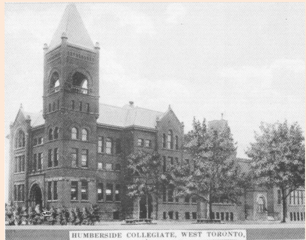
The importance of Humberside is indicated by its being featured on the postcards of the time. This photo dates to 1911 and shows the newly completed west wing.

John Ellis, a noted west end architect designed the building . “Cyclopean lintels were placed over the windows and on the third floor, arches of distinct Romanesque character marked the fenestration. A massive arch marked the main entrance. A heavily detailed glass and oak set of doors completed the entrance which was set at the top of a flight of ten steps. Dentilated and basket-woven brickwork completed the picture-postcard intricacy of the building façade. (For those involved in sports and clubs that door was the back drop for pictures.)