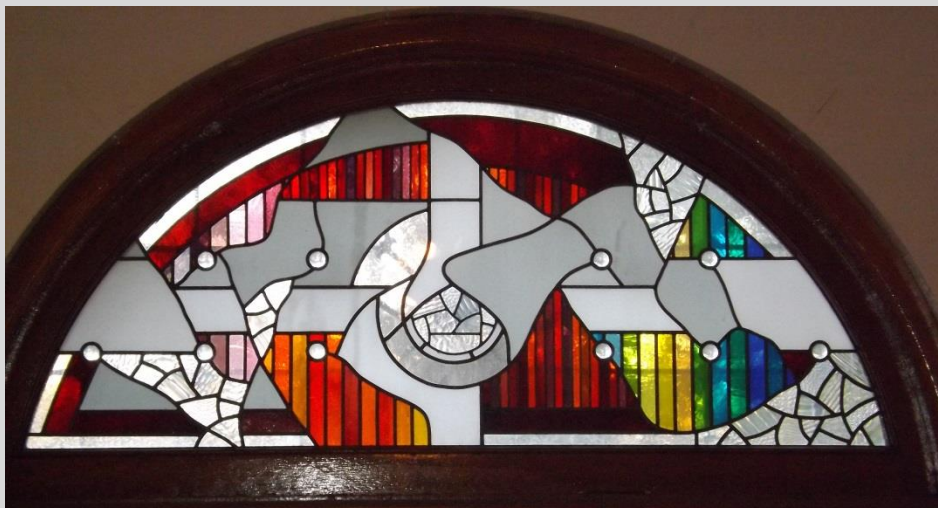
stained glass above the front door entrance

PS: The Alumni Committee is planning an Annual General Meeting mid-February. Date and time TBA Information will be sent out soon.