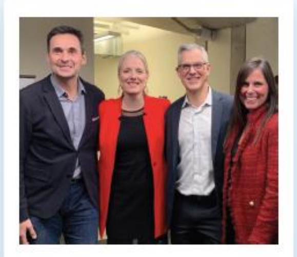
OPAD team meets with the Honourable Minister of Environment and Climate Change Catherine Mckenna.